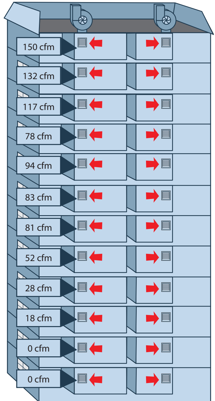
Unregulated Unbalanced Airflows Over-ventilation causes energy waste, Under-ventilation causes poor indoor air quality (IAQ)

pitot tube pressure-sensing devices and electric drive motors and controllers to actuate a damper for flow control. Using one of these devices on every intake point in a riser is often more costly than years of energy penalties on systems without them.