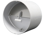
PAX Backdraft Damper Optional