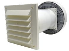
PAX Wall Duct Kit Optional