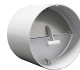
PAX Backdraft Damper Optional Part No. 89 553