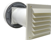
PAX Wall Duct Kit Optional Part No. 89 555