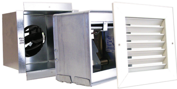
Airflow Regulator Assembly