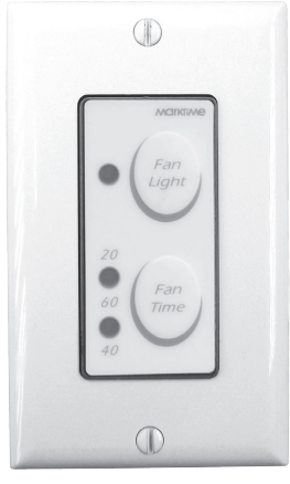
Wall plate not included